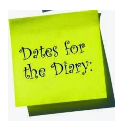
1 - Important Dates

Wednesday 8th February 2023 - Occasional Day (closed for children)